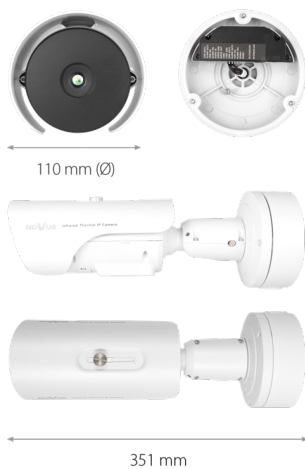
IMAGE - THERMAL MODULE