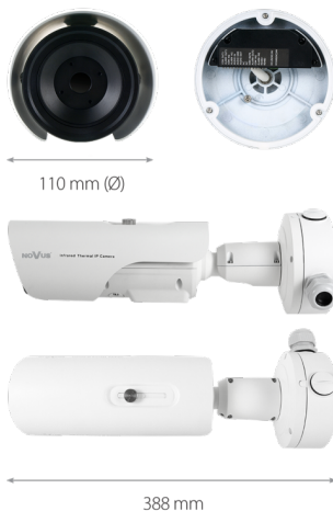
IMAGE - THERMAL MODULE