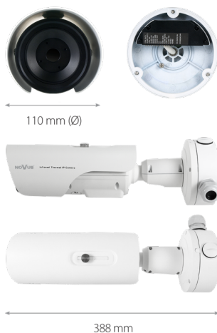
IMAGE - THERMAL MODULE